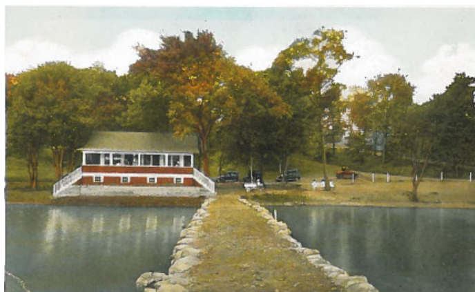
The old Pavilion at First Beach