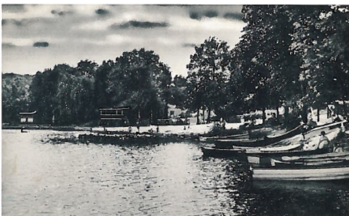
THE LAKE HAYWARD CLUB HOUSE AND BATHING BEACH 1929