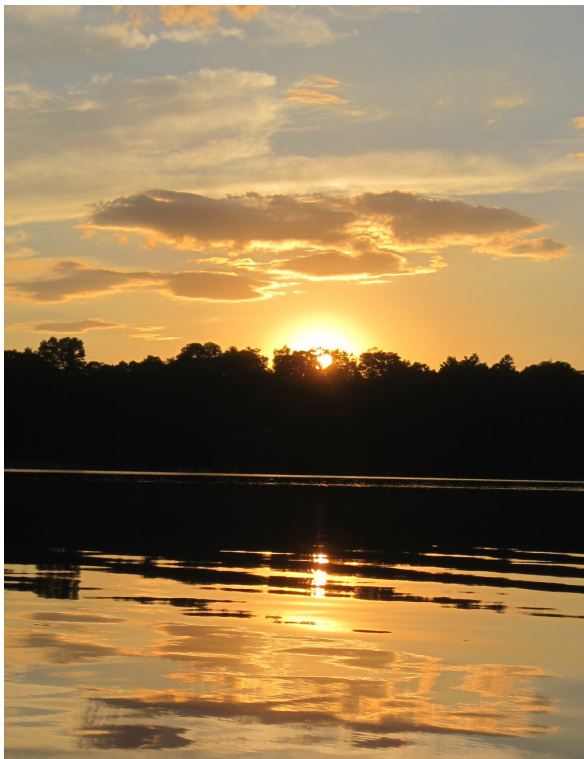
A view of the lake