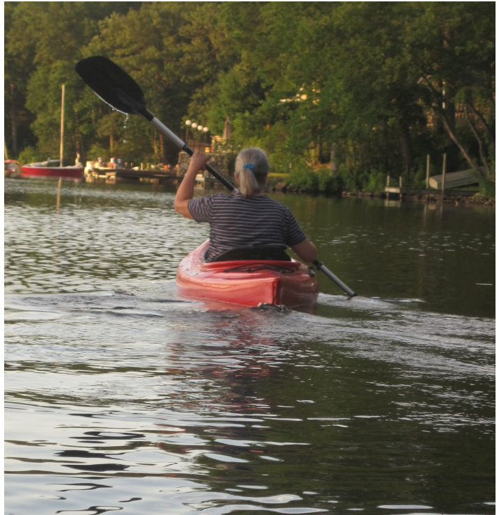
Enjoying an evening paddle.