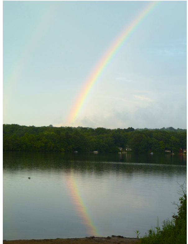
Rainbow over Lake Hayward