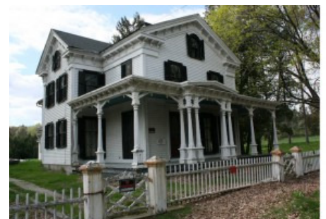
Emory Johnson Homestead