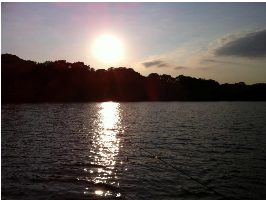
Sunset on the lake