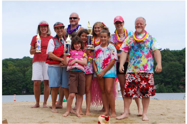
All of the boat parade winners