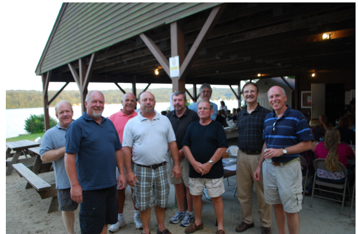
Ladies' Night "staff"