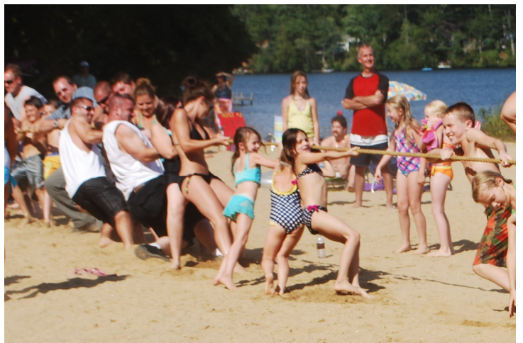
Tug of war