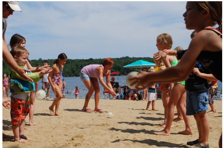
Water balloon toss