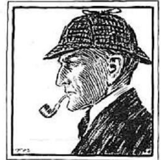
Illustration from life by Frederic Dan Steele William Gillette as Sherlock Holmes

The Interior of Gillette Castle is open for tours from Memorial Day Weekend to Columbus Day from 10am-5pm. There are hiking trails on the grounds, some of which follow, over trestle and through tunnel, the actor’s three mile long narrow gauge railroad.