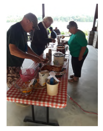
The Pasta Challenge took place Sunday as part of Lake Hayward Days. See more on Page 3.

solution and what it might cost. The best way to get action is to be willing to participate in the solution. The board is a sounding board. They will consider your comments. They might not come up the solution you personally want because it is their charge to think of the whole membership and fit a solution to current plans. I hope that future boards find it smooth sailing. Please know