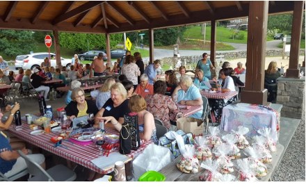
Chocolate Bingo and Ladies Night saw big crowds of lake residents come out to the First Beach Pavilion to enjoy these Lake Hayward Days events.