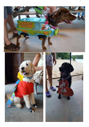
Roxy, Murphy and Luna were hits at the Doggie Costume Parade. More on Lake Hayward Days on Page 2.

Keeping the beach free of waterfowl droppings has made a big difference in the appearance as well as health of Third Beach and trying to manage the many new watercraft has been a challenge of late. These issues were solved only by the