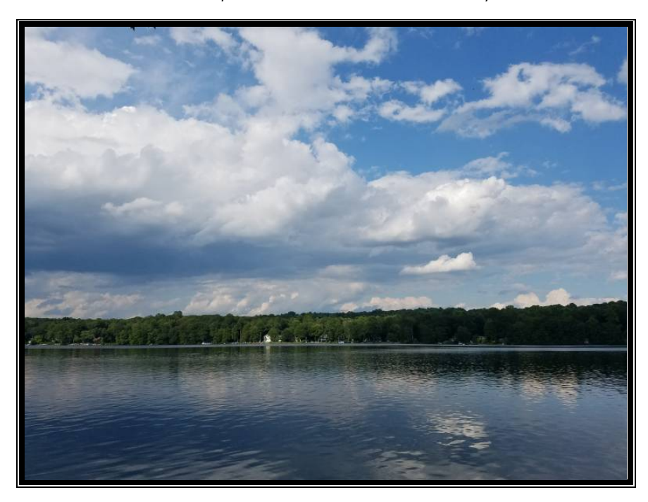
Welcome to the 2020 season. This packet of information is for you to reference and keep on hand for you and your guests. Additionally, there is a copy on the Lake Hayward website Lakehaywardct.com.