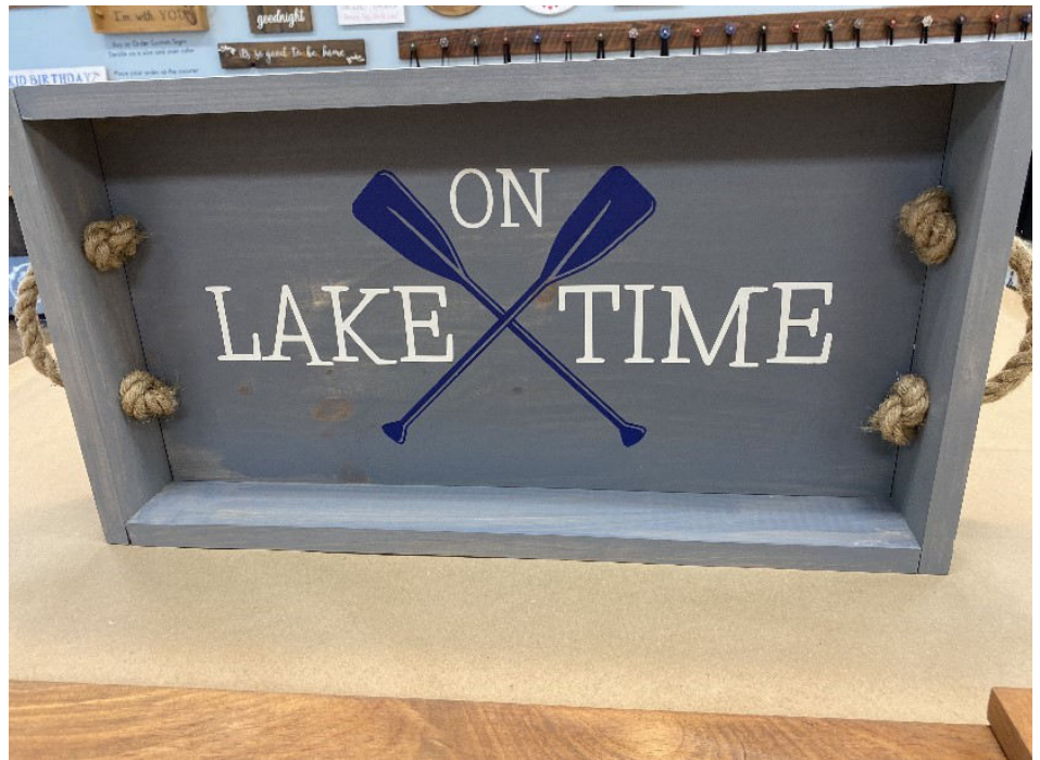
Here is just one example of a custom item you can make on July 24.

July 11, 2-4 p.m.: Tie Dye Teen Craft (Kids ages 12 and up) We are trying to