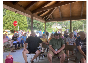
The Annual Meeting was well-attended.