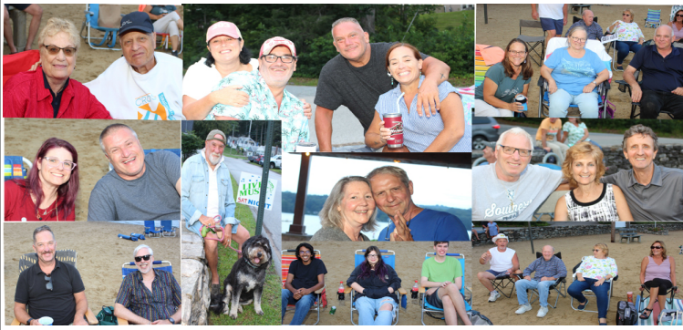
Photo Memories of String of Pearls Big Band Concert